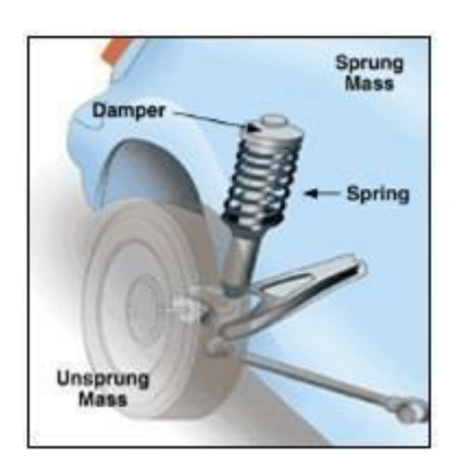
Figure 1.1 Primary suspension system