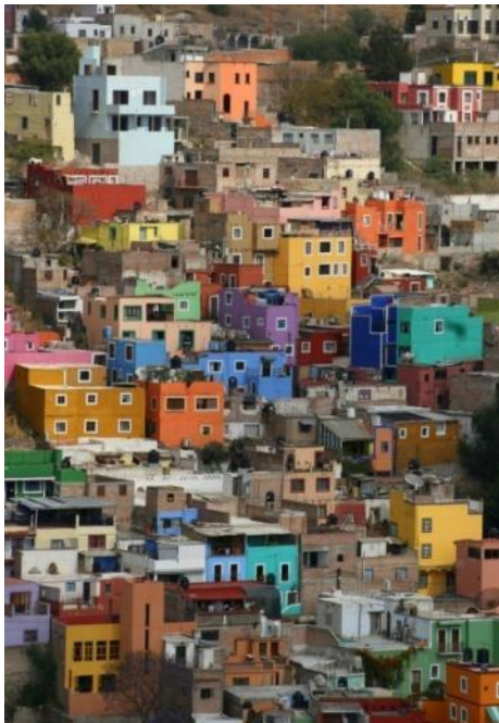
Microsoft Office clipart

Color has an immediate and profound effect on a design.