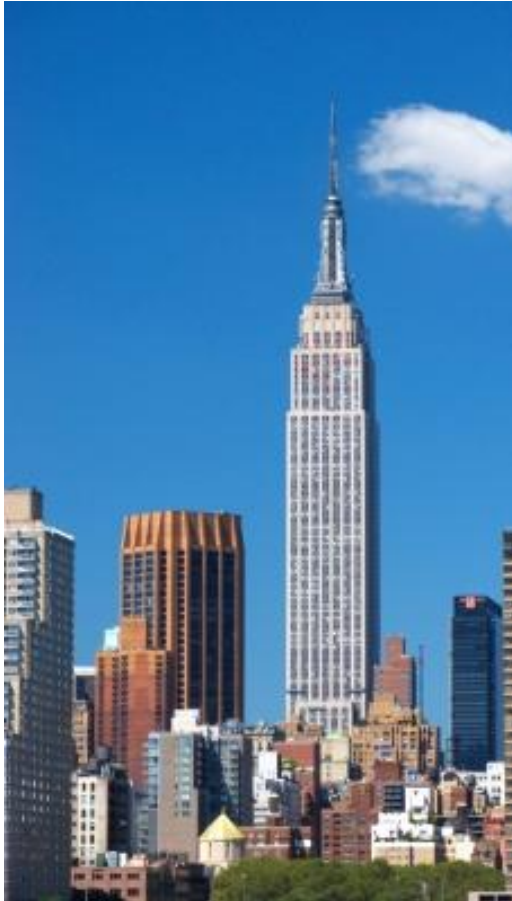
The Empire State Building Architect: Shreve, Lamb, and Harmon