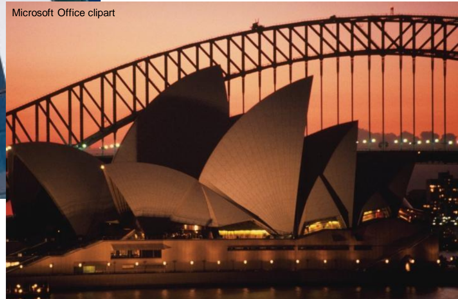
Sydney Opera House Jorn Utzon