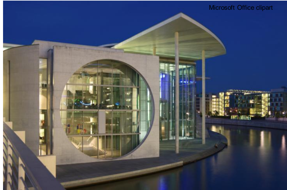
Marie-Elisabeth-Lüders-Haus Berlin, Germany