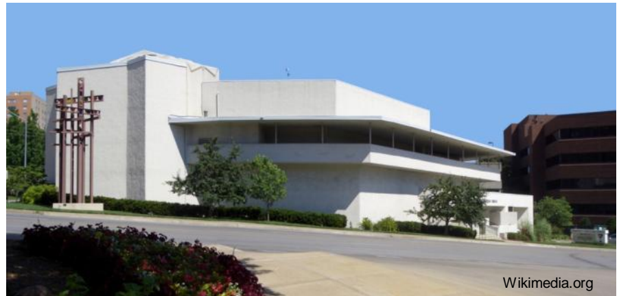
Community Christian Church Kansas City, MO Architect: Frank Lloyd Wright, 1940