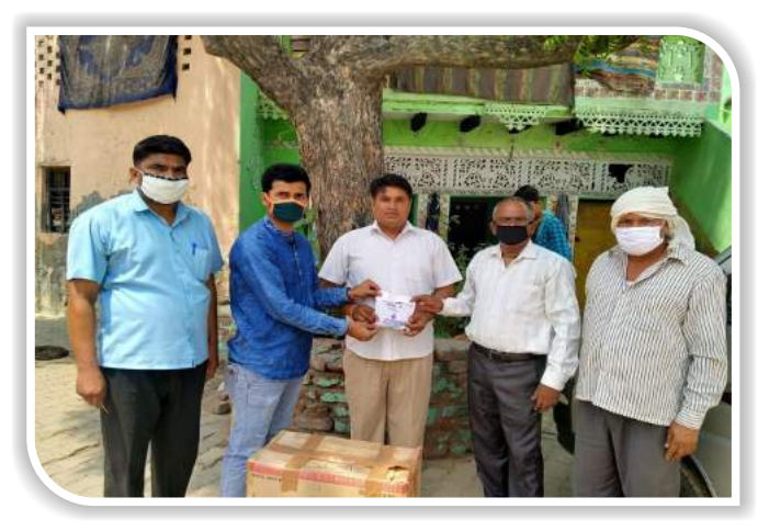
LEGAL AWARNESS CAMP