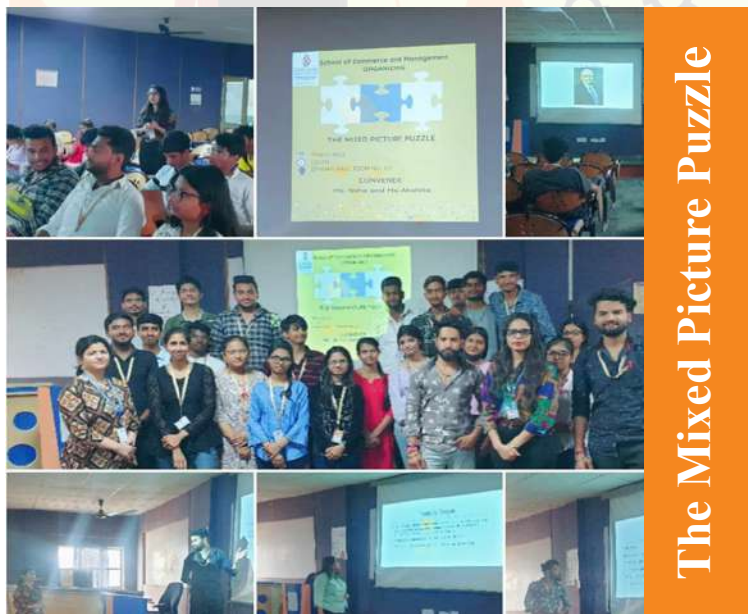
The Mixed Picture Puzzle

The objective of teamwork and collaboration activities among management students is to develop their skills and abilities to work effectively in teams and achieve common goals. This is important because most modern organizations require employees to work collaboratively to achieve objectives, and the ability to work in a team is an essential skill for success in today's business world. By engaging in teamwork and collaboration activities, management students can develop several key skills, including communication, leadership, problem-solving, decision-making, and conflict resolution. With this in mind the School of Commerce and Management organized this activity to help students understand the importance of teamwork.